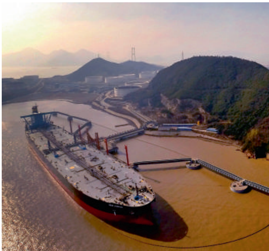
Oil supply is plentiful so high prices cannot be justified

There have never been any shortages to justify $100/bbl prices. Instead, prices were driven higher by pension funds' search for a 'store of value' to counter-balance the US Federal Reserve's perceived aim of devaluing the US dollar. They found this in oil as it was (unlike natural gas), a major international market, and easy to enter as a financial investor due to its deep and liquid futures market.