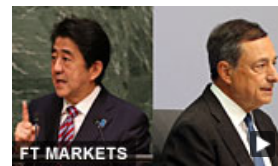
Europe and Japan stocks to outperform

Printed from: http://www.ft.com/cms/s/0/f18fd91c-78d8-11e5-933d-efcdc3c11c89.html