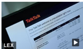
Business impact of attack on TalkTalk